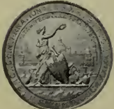
Sydney 1879 First Prize Gold Medal

For men. The best watch that can be made. Cased and timed at the factory. Price, $250.00 in 18k. Solid Gold Open Face Case.