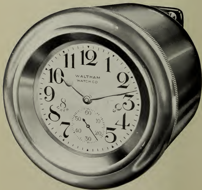
WATERPROOF CASE—MODEL D