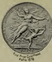
First Prize Gold Medal Paris 1878