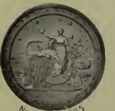
New Orleans 1885 Five First Prize Medals

Send for booklet describing Waltham watch movements, and containing information of great value to any one interested in the pur- chase of a watch.