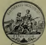
Cincinnati 1880 First Prize Gold Medal