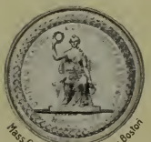
Mass Charitable Mechan Assoc Boston First Prize Gold Medal