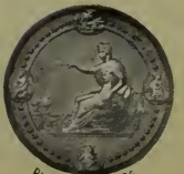
Philadelphia 1876 Four First Prize Medals