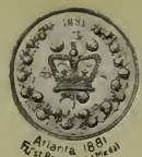
Atlanta 1881 First Prize Gold Medal