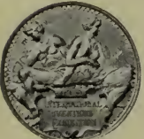
London 1865 First Prize Gold Medal

For years the best watch made, and now only exceeded by the “Premier.” Three sizes, for men and women.