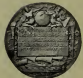
Chicago 1893 Seven Medals and Diploma