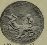
Jamestown 1907 Highest Award Gold Medal

The most famous Railroad Watch in the world. Two sizes — Equipped with wind- ing Indicator.